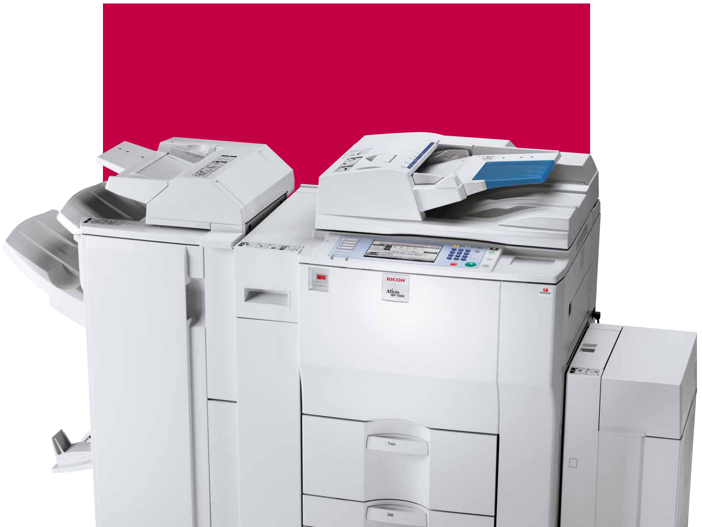
Aficio™ MP 7500